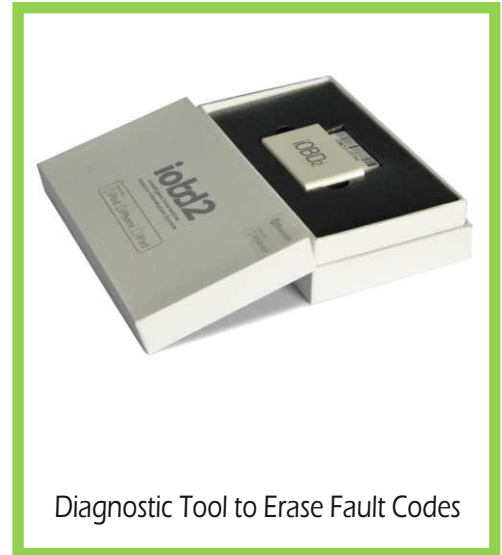
Diagnostic Tool to Erase Fault Codes

Built-in Cooling Fans: The internal cooling system is designed to maintain optimum temperature for stable system operation.