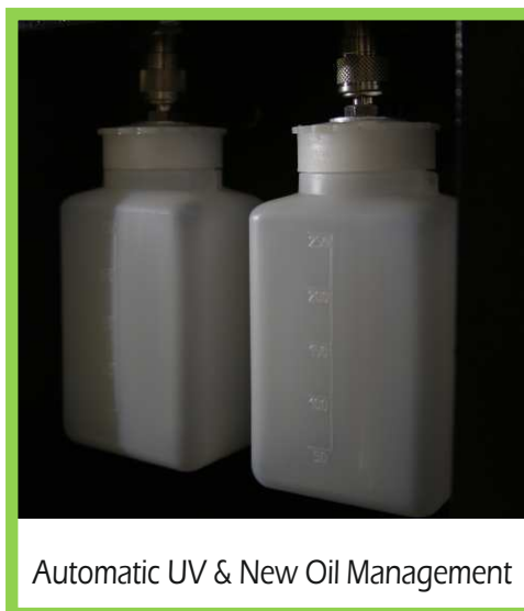
Automatic UV & New Oil Management