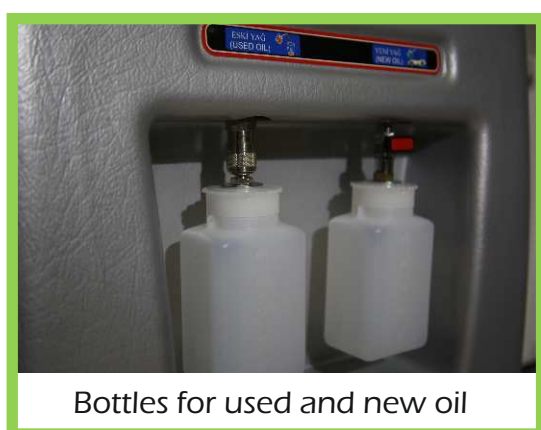
Bottles for used and new oil

Storage pocket for tools: The unit is equipped with integral tool storage pocket.