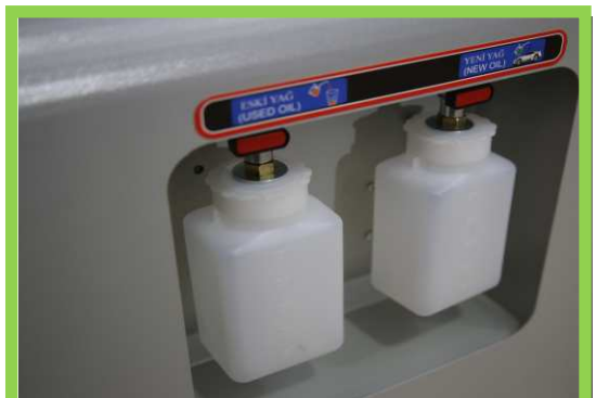
Bottles for used and new oil