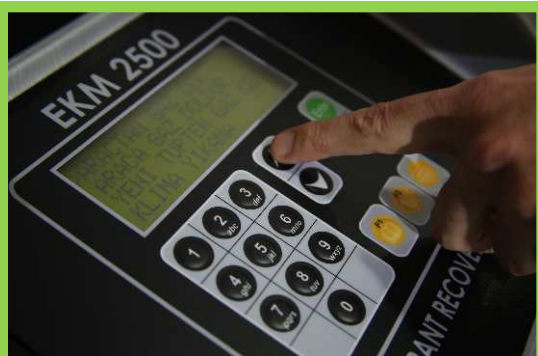
4x20 LCD Display

EKM 2500 is a full automatic complete air conditioning service center for R134a. It recovers, recycles and recharges refrigerant quickly and accurately. A microprocessor controls the units functions and prompts on the display to lead the operator through the operation. The entire service procedure can be done with one hook-up to the vehicle. The equipment is made of high tech ultra-reliable components and user friendly control panel makes every technician an A/C expert. EKM 2500 enables the user to track the recovered, recharged and available refrigerant amount accurately and continuously. And it is supplied with a long term memory for cumulative refrigerant management.